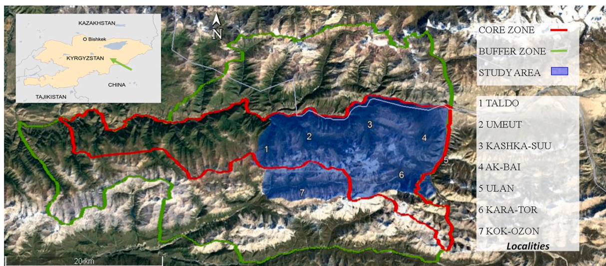
Fig. 1. Map of the study area in and around Naryn State Nature Reserve; Numbers on the map are referring to localities insert in the right bottom corner.

They registered fauna on the spot, all year long, except if unintentional triggers saturated the SD card and exhausted batteries or if the camera was damaged by fauna. The camera traps were checked at least once every summer, sometimes more often.