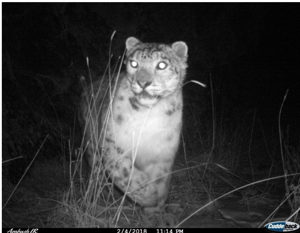
Snow leopard captured on Kizil Keregue and Tchong Koilu camera traps