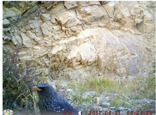
Female Tien Shan argalis and a Blue whistling thrush on camera trap

13.08 → Group 1: left bank of Sarychat river (cliffs) and Sarai d'Atcha