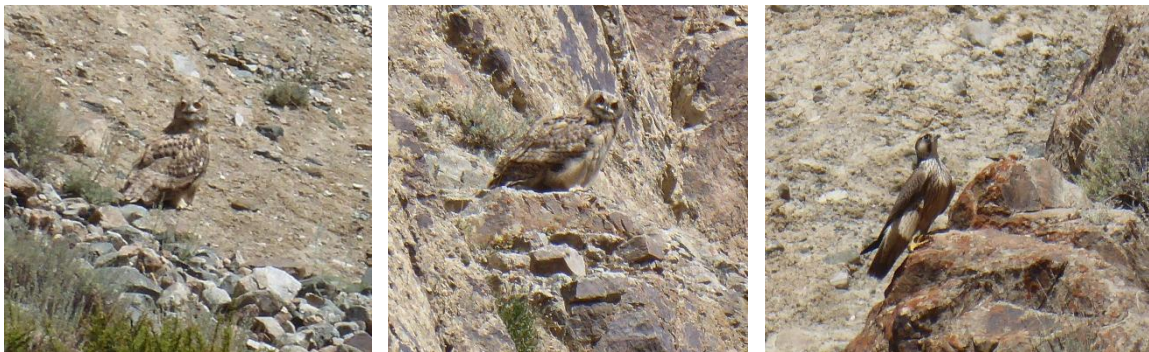
Eurasian eagle owl (adult and young) and Eurasian hobby

Observations: 31 female Argalis with youngs at the entry of the valley; scrapes and footprints of Bear; one scrape, two fresh feces ( 2 samples taken ) and urine of Snow leopard in the lowest part of the river, one Gldentstdt's redstart.