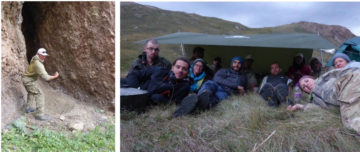
Nest of Bear with Mishka and Bivouac in Boroko valley

12.08 → Group 1: direct ride to Atcha to set up camp