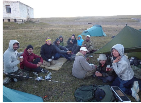
Fox and dinner at 4000 m above sea level