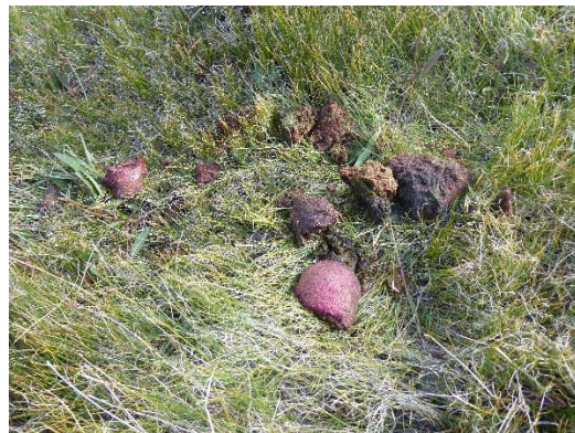
Fox hunting rodents and really fresh Bear feces.