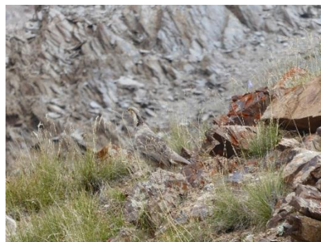
Lammergeier and Himalayan snowcock