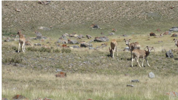
Young males of Tien Shan argalis

Camera trap (n°15): unfortunately stopped working after 2 weeks, triggered by the cliff shadow, apparently no animals on the recordings except a Large-eared pika ( Ochotona macrotis ).