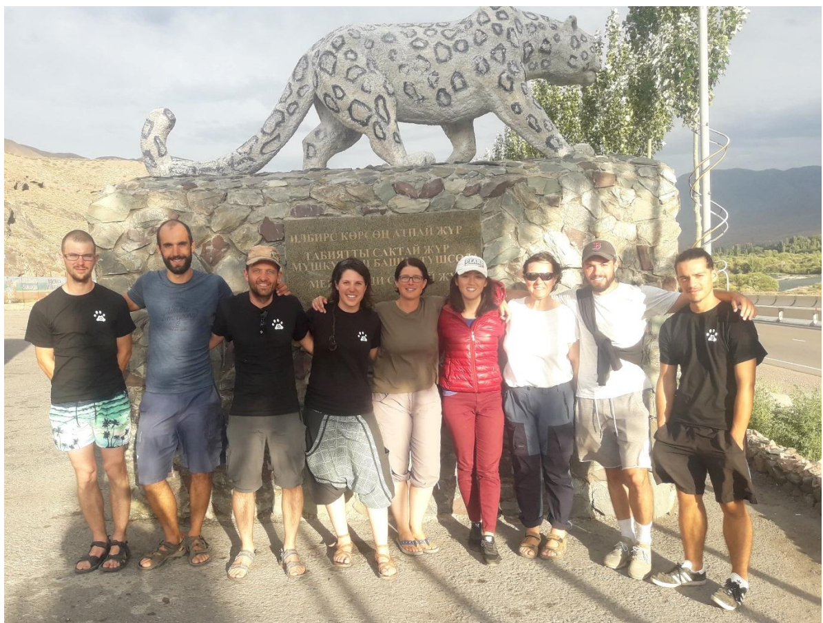
On the way back to Bishkek