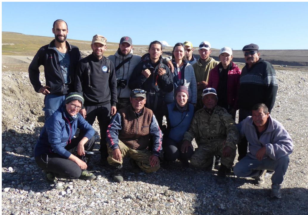
The europeano-kyrgyz team !