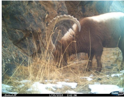
2 Bears hunting Marmots and a Siberian ibex male on camera trap