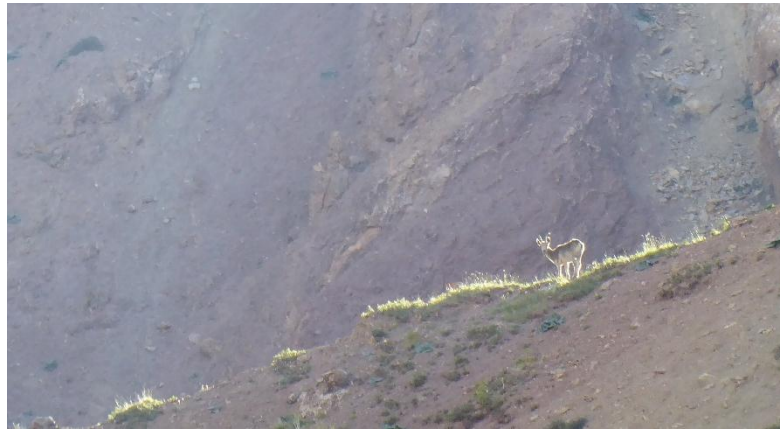
Female of Tien Shan argali

Observations: 1/ narrow valley on the left bank - 2 scrapes and a pug mark of Bear; Wolf markings (old feces, old pug marks); 2/ group of boulders on the slope of the Ortho Bordu crest, at the eastern end of the valley (right bank) - old track of Snow leopard; on the way - Bear diggings into marmot holes, 30 female Siberian ibexes and 46 female Tien Shan argalis.