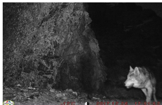
Team at the bottom of Ortho-Bordou and Wolf on Boroko camera trap